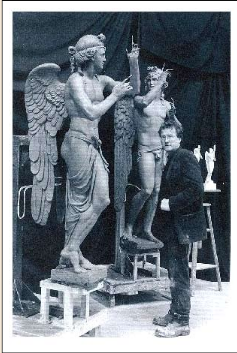
Two Genii for Buckingham Palace, clay models in production. Picture courtesy www.alexanderstoddart.com .

RECENTLY NAMED HER MAJESTY'S SCULPTOR IN ORDINARY IN SCOTLAND IN RECOGNITION OF HIS OUTSTANDING CONTRIBUTION TO BRITISH CULTURE