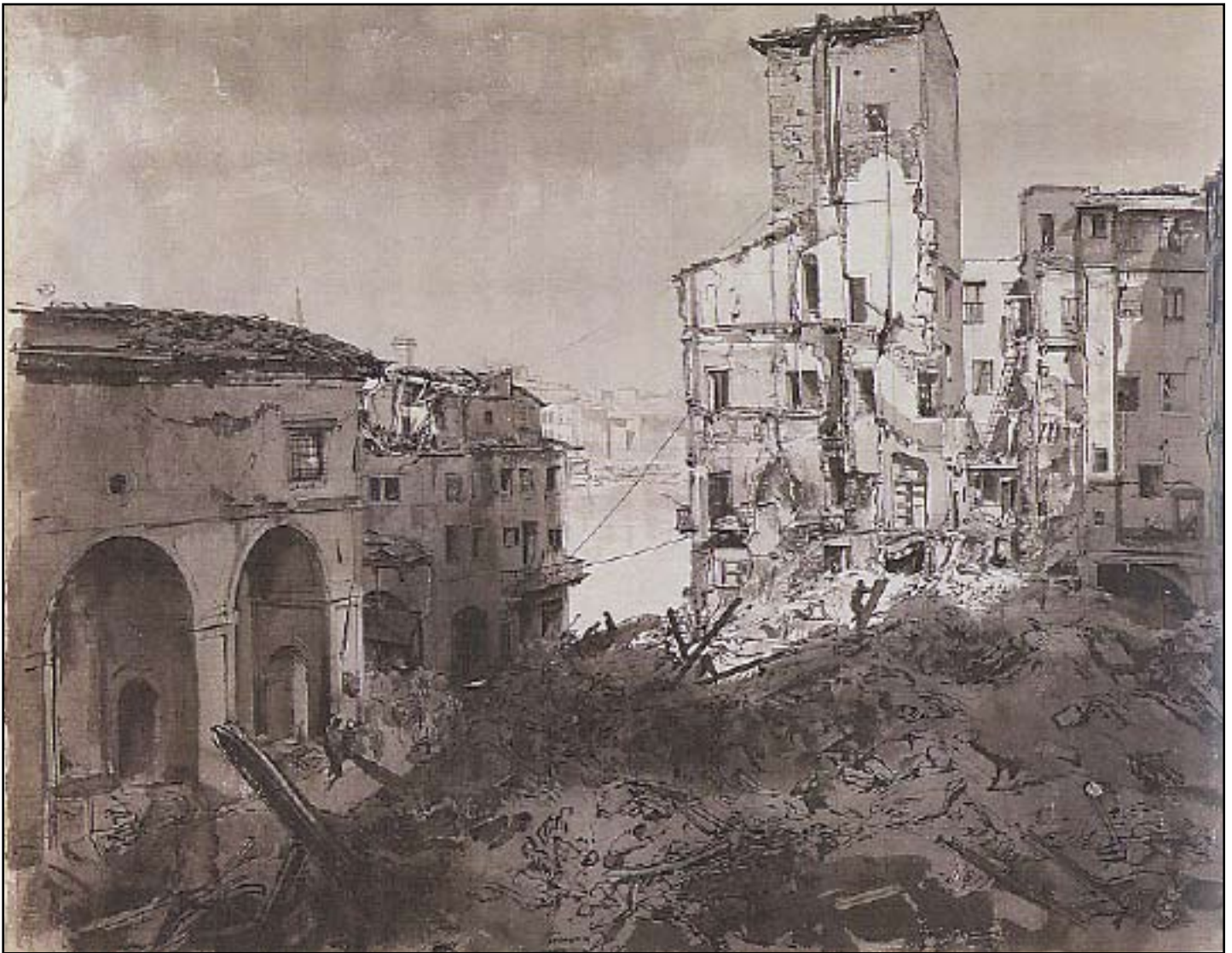
Above: Annigoni, Distruzioni di Firenze, Torre del Leone (dalla Canonica di S. Stefano) , 1944 Below: Demolished Chapel, Brownson Memorial Presbyterian Church, February 2009