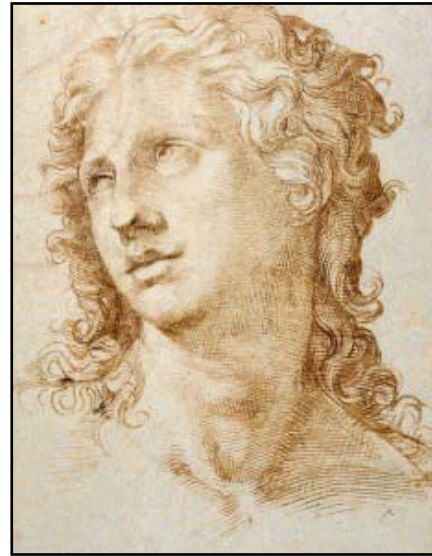
Passerotti, Male Head , Museo Nacional del Prado, Madrid

Beginning in March, all students will be scheduled for supplementary life projects at our Weymouth Studio. Working under natural north light, students will be presented with a set of new challenges to build on previous training, and are encouraged to develop individual projects for study of the human form.